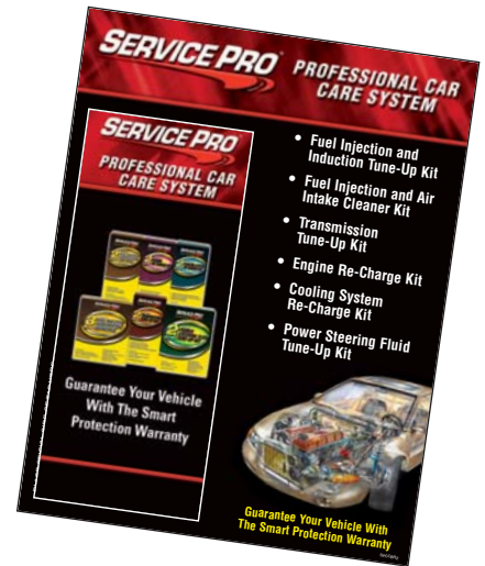
Tri-fold Brochure SPCCBR Tri-fold Brochure Holder SPCCBR2