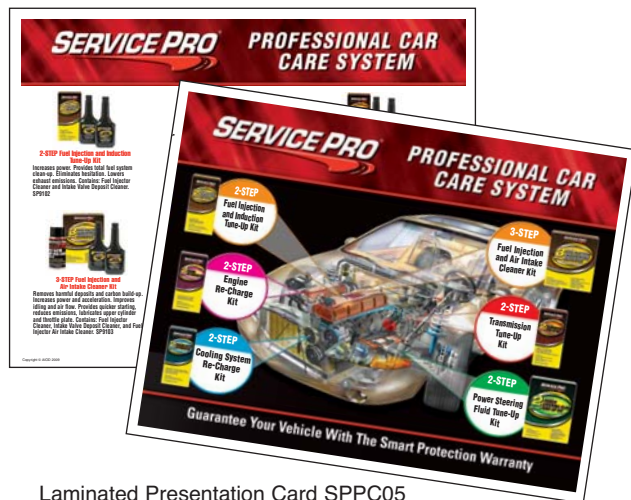
Laminated Presentation Card SPPC05