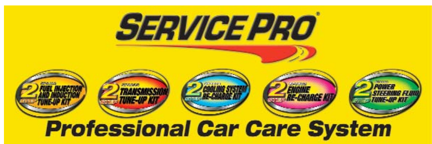
Bay Banner SPIB004