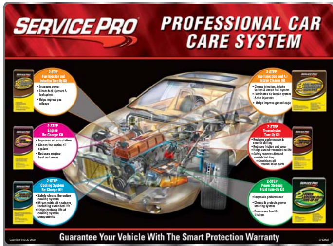
Counter Mat SPCM02

Get your customers' attention and earn more profits! Service Pro® now offers professional point-of-purchase materials and a step by step training DVD. Each piece is designed to assist you to more effectively present and sell the benefits of preventative maintenance.